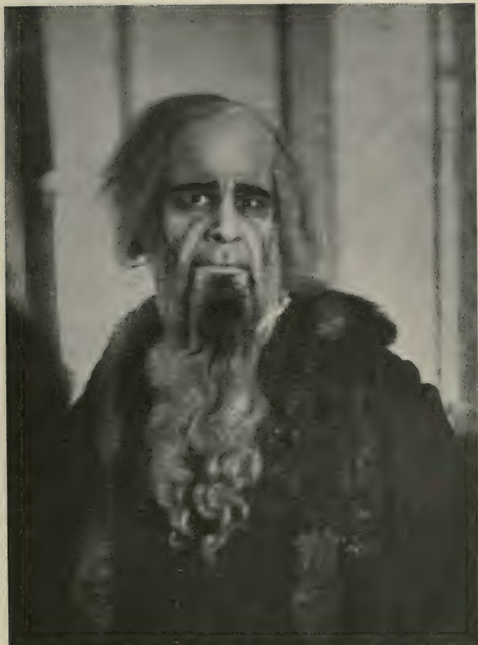
MANSFIELD AS SHYLOCK (First Alteration in Make-up, Late in 1893)